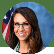
Lauren Boebert Republican Congresswoman

Sol Sandoval, CO State Rep. Donald Valdez