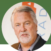
Joe O'Dea Republican Corporate CEO

Planned Parenthood Action Fund, Service Employees International Union