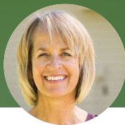
Barbara McLachlan Democrat State Representative

Votes on state bills on climate justice, health care, and reproductive rights