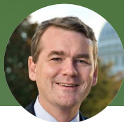
Michael Bennet Democrat U.S. Senator