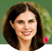
Jena Griswold Democrat CO Secretary of State

Ensures valid state elections, enforces campaign finance laws, & updates voter file