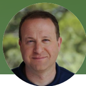
Jared Polis Democrat CO Governor