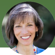
Tammy Story Democrat State Senator